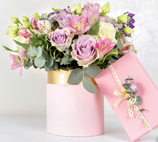
Floral Arrangements starting at $59 Unique Flowers & Gifts

Adorn the tables in gorgeous fresh blooms! I love all the colors in this arrangement and know it would look stunning at any brunch.